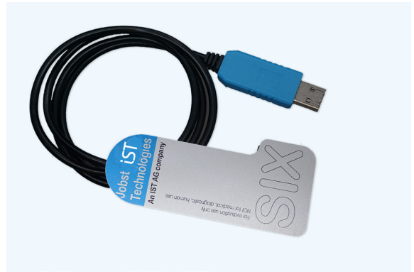
Encased „Six“ with USB connector