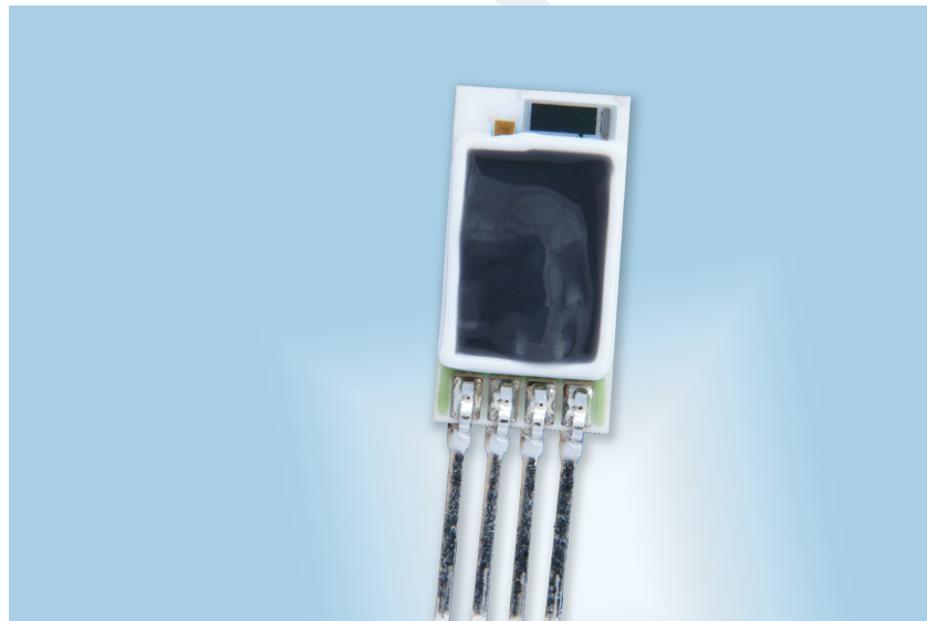
For actual size, see mechanical dimensions