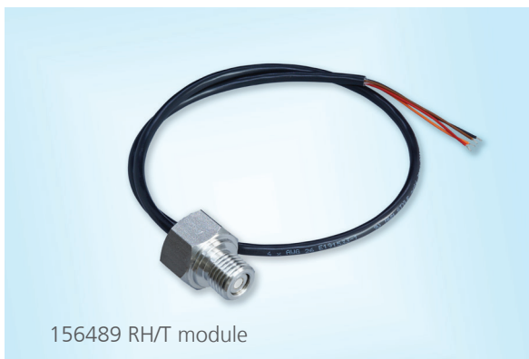
156489 RH/T module

Optional: PTFE filter for particle and VOC retention when required for extended exposure under harsh industrial conditions: