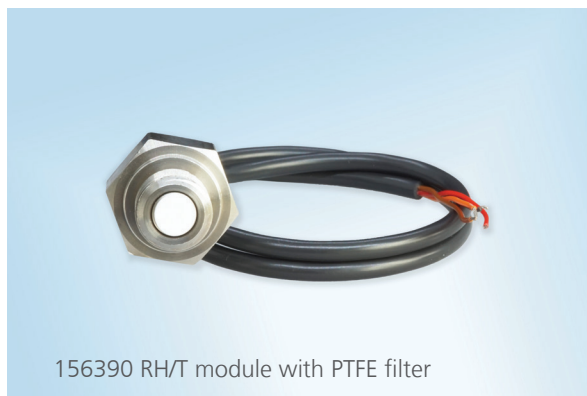
156390 RH/T module with PTFE filter